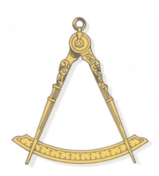
Jewel of the 5th Degree – Perfect Master

So what is the difference between Fate and Destiny? A simple search online revealed that "Fate" implies a lack of control or inevitability, while "destiny" suggests a sense of purpose or direction that can be influenced by personal agency. I can't help but think of how this relates to the 5th Degree, Perfect Master.