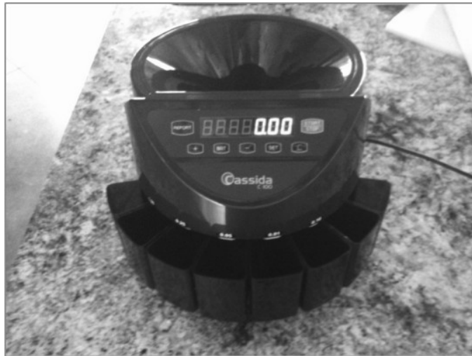
The new "Piggy Sorter"