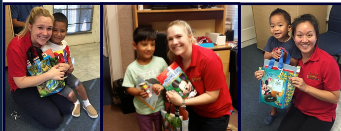
Please enjoy the pictures of some of our children receiving their supplies.